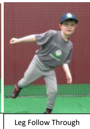
Leg Follow Through