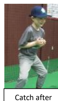
Catch after cradle