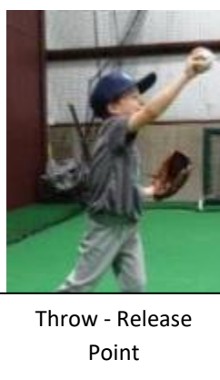
Throw - Release Point