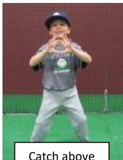
Catch above waist