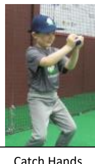
Catch Hands Out