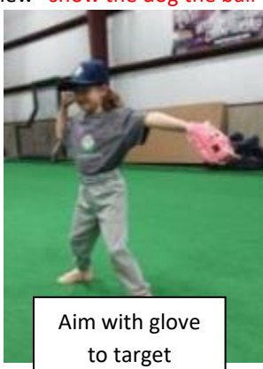
Aim with glove to target