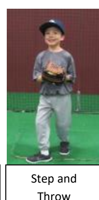
Step and Throw