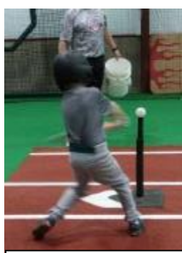
Swing/Squish bug at contact