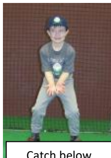
Catch below waist